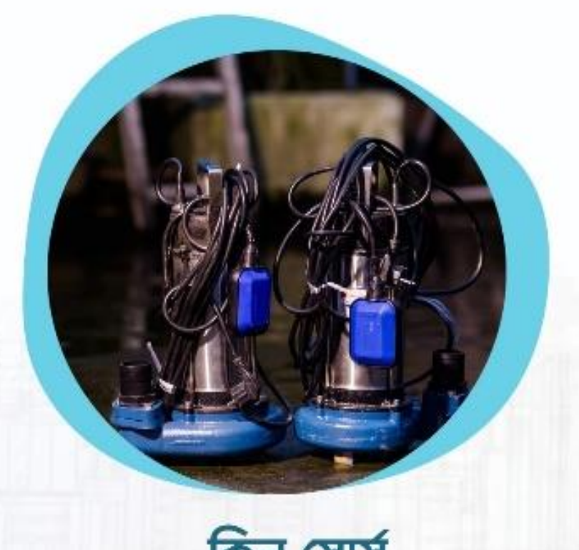
ক্রিন সোর্স সাবমারসিবল পাম্প দিয়ে ট্যাংকের অতিরিক্ত পানি অপসারণ করে